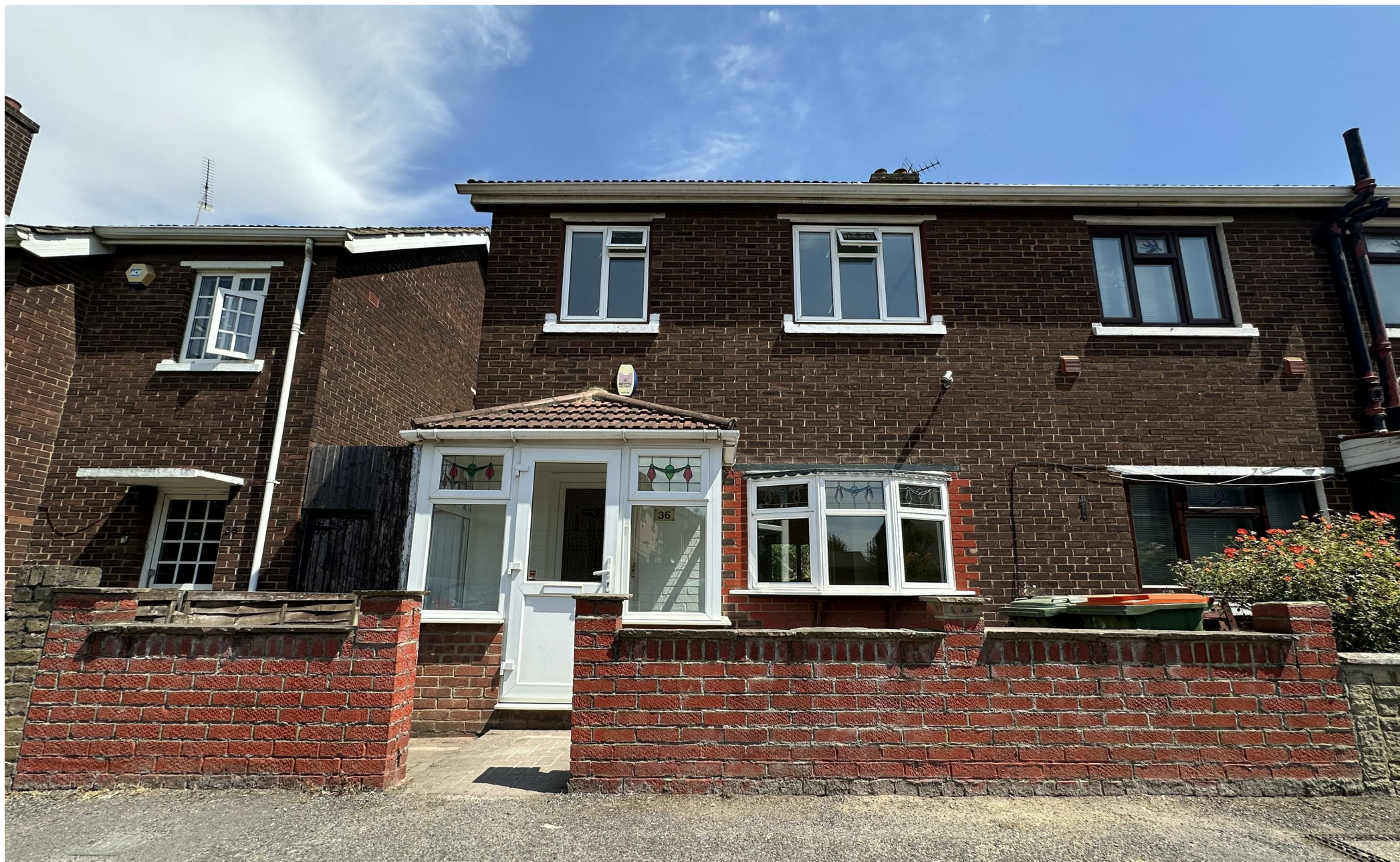
36 Mill Road, London, E16 2BE £2,800 Per month